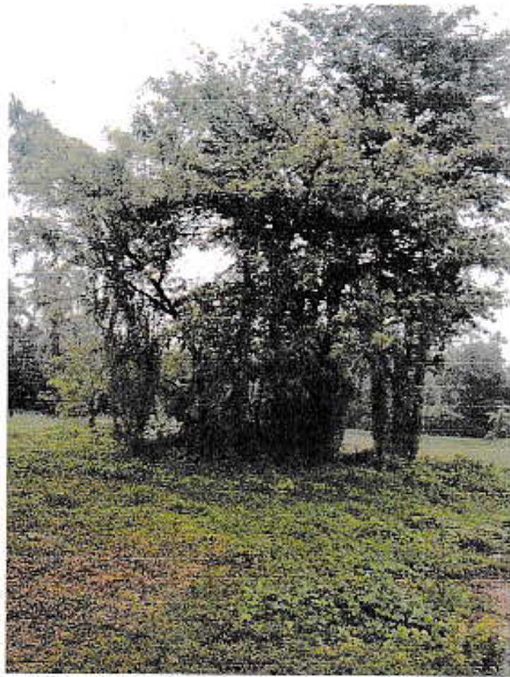
Figure 4 RECOMMENDED SPACE FOR NAKSITRAVANAM