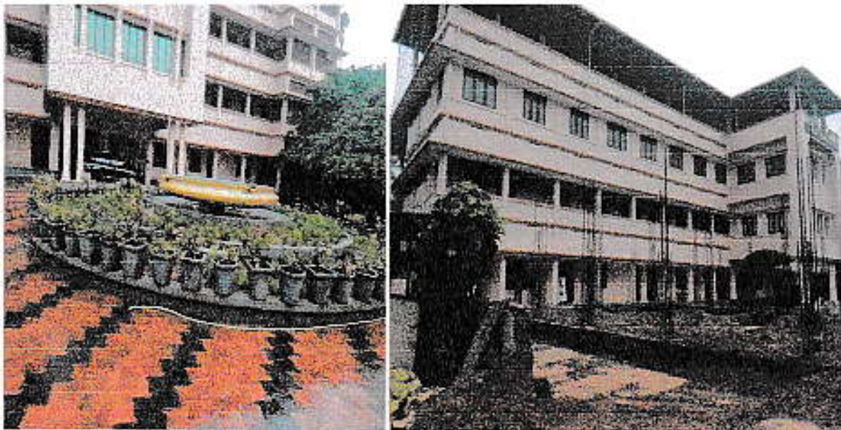
FIGURE 2: CAMPUS BUILDINGS VIEW

The environment in and around the college campus plays an important part in maintaining a healthy atmosphere in nurturing talents. Trees are the major source of the oxygen we breathe, and receiver of the carbon dioxide we exhale. The sustainability of an ecosystem depends on the number of plants and trees in and around the surroundings. The open space in the college is used for gardening and maintain, open ground, silent zone etc. Ultimately the campus is maintaining natural equilibrium with nature