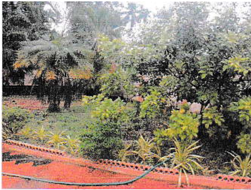
Figure 3 LEISURE PARK