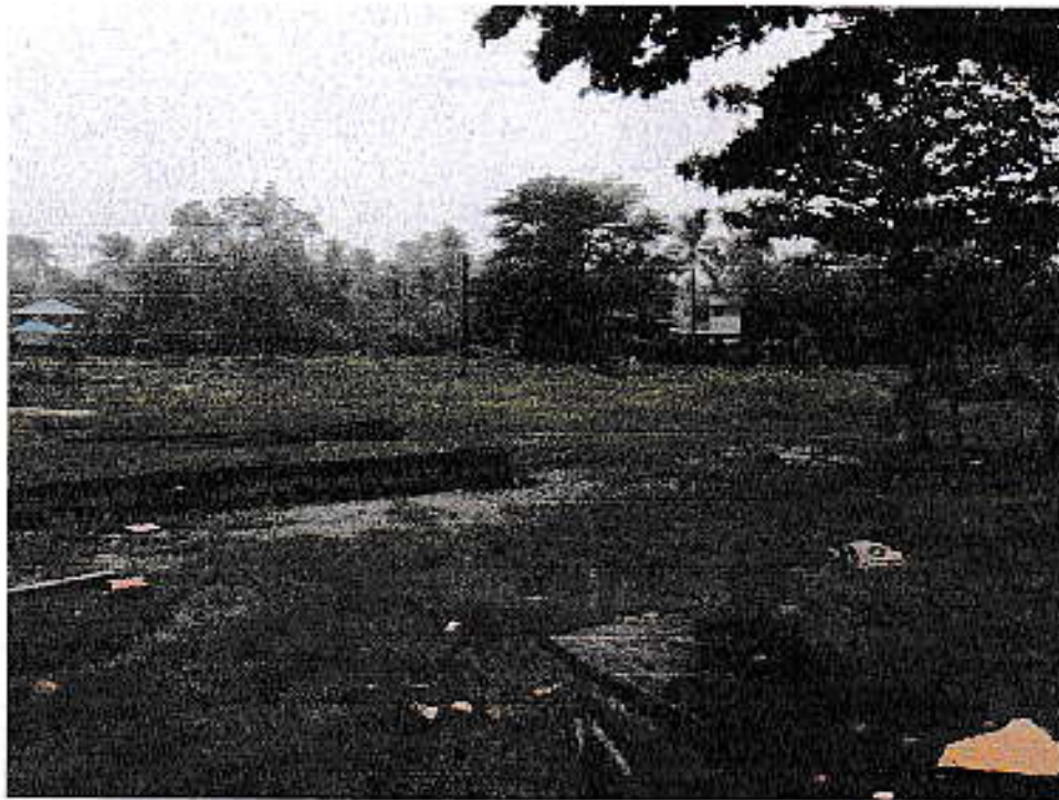
Figure 6 OPEN GROUNDS

Education is incomplete without sports and games. Sports and games are beneficial in teaching us punctuality, responsibility, patience, discipline, and dedication towards our goal. The importance of games and sports in student's life is immense. It has proved to be very therapeutic in nature. Sports help improve stronger social skills, such as dispute management and sport-based interaction. Sports inculcate the feeling of fairness in a child and it encourages them to be committed, taking defeat in a positive manner. It teaches us to be joyful, united, and appreciative in life. Students are the youth of our Nation, and they need to be energetic, physically active, and mentally fit. By understanding the responsibility to make its students as healthy Euphrasia Training College management built and maintained football ground, cricket ground in a greenery surroundings.