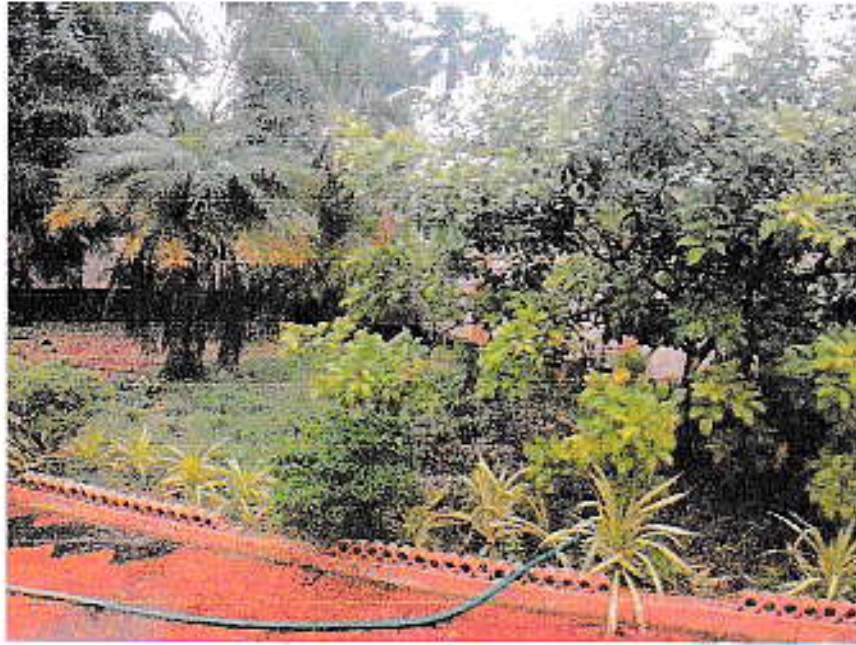
Figure 3 LEISURE PARK