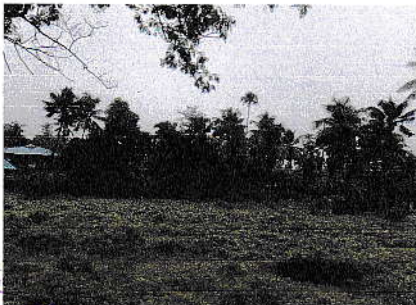
Figure 5 SILENT ZONE

Nowadays, silent zones are getting important in academic institutions. Noise pollution leads to stress and other medical and neurotic problems in children. Besides, creativity and knowledge absorption capacity is also going down. For reduction of academic stress level there is place for complete relaxation. This is the importance of silence zone. Euphrasia College has have certain silent zones in the college itself. Natural silence zones are also created in the college campus where there is no sound other than natural sound