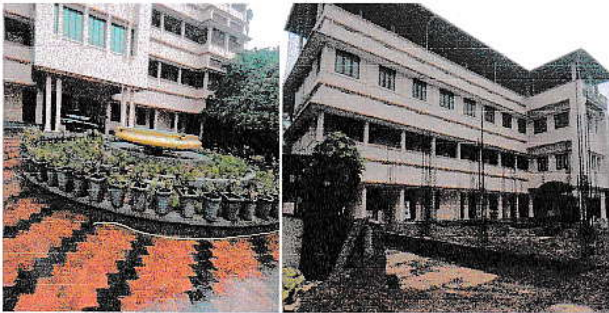
FIGURE 2: CAMPUS BUILDINGS VIEW

The environment in and around the college campus plays an important part in maintaining a healthy atmosphere in nurturing talents. Trees are the major source of the oxygen we breathe, and receiver of the carbon dioxide we exhale. The sustainability of an ecosystem depends on the number of plants and trees in and around the surroundings. The open space in the college is used for gardening and maintain, open ground, silent zone etc. Ultimately the campus is maintaining natural equilibrium with nature