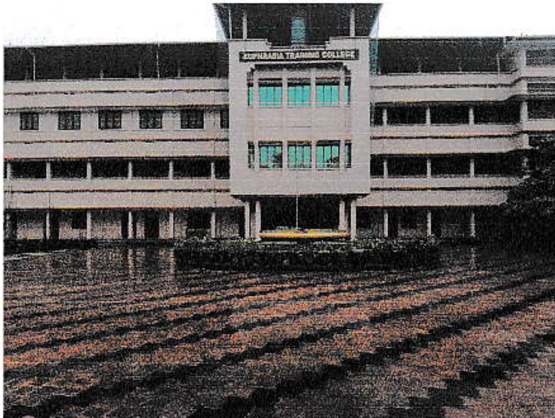
Figure 1 EUPHRASIYA TRAINING COLLEGE FOR WOMEN MAIN ENTRANCE

To mould outstanding teachers with high social commitment and radiate moral and spiritual values by providing quality education and systematic training.