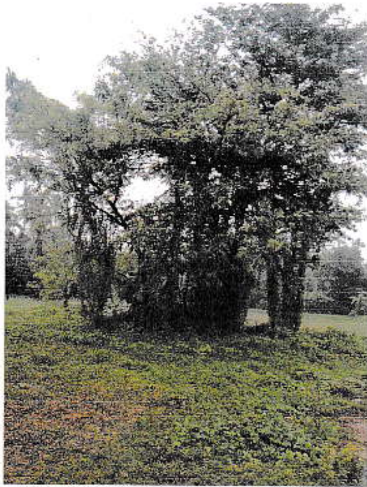
Figure 4 RECOMMENDED SPACE FOR NAKSITRAVANAM