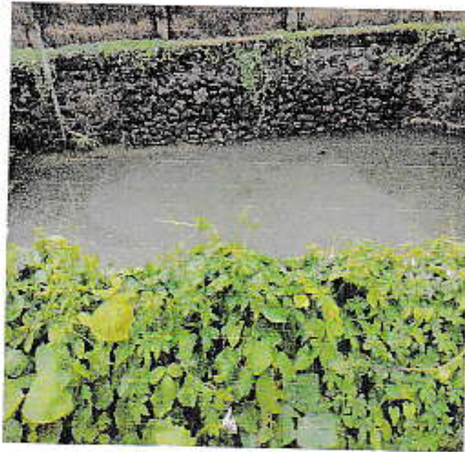
Figure 7 FISH POND

The requirement of water for the college met by supply from one Open wells. And gardening and other outside requirements water from the pond is used. . The water from OPEN well are collected in THREE tanks of capacity of 3 KL synthetic tanks. The water from different wells are checked in an accredited laboratory in time to time to ensure its portability